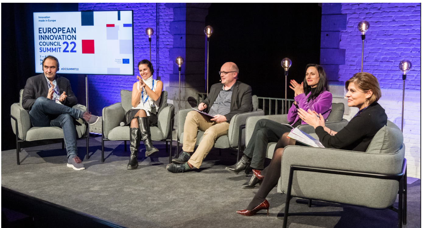
Commissioner Gabriel engaging with the Coalition of the Willing at the European Innovation Council Summit 22

Press contact: jan.bormans@europeanstartupnetwork.eu